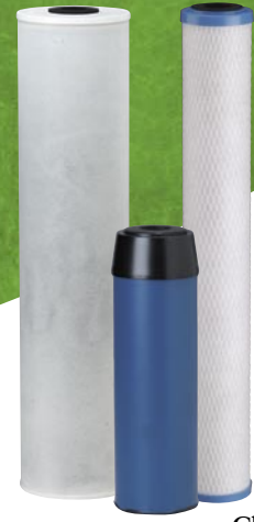
CRFC-20BB CGAC-10 ChlorPlus 20