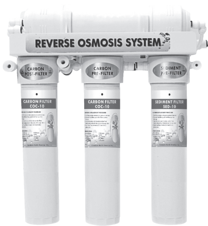
475 Pro Series