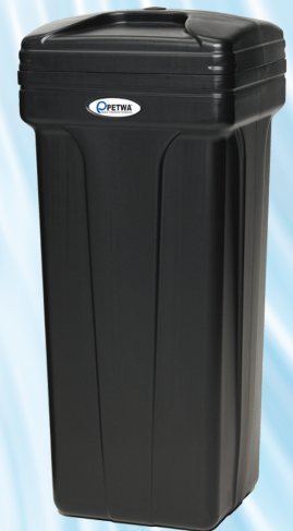
Brine Tank Included